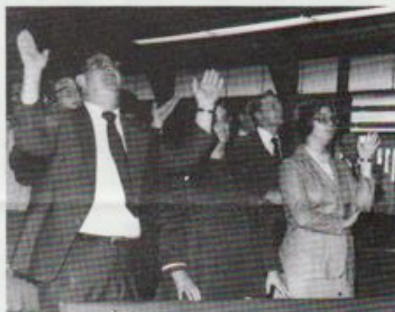
Rejoicing in His Presence!