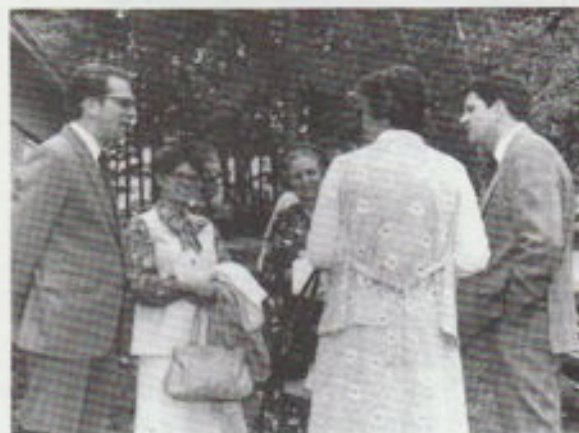
Fellowship is sweet!